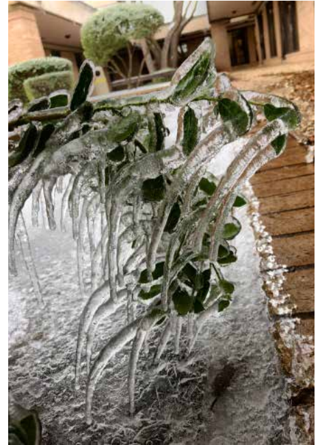
"Nature never deceives us; it's we who deceive ourselves." – Jean-Jacques Rousseau. Texas ice storm.