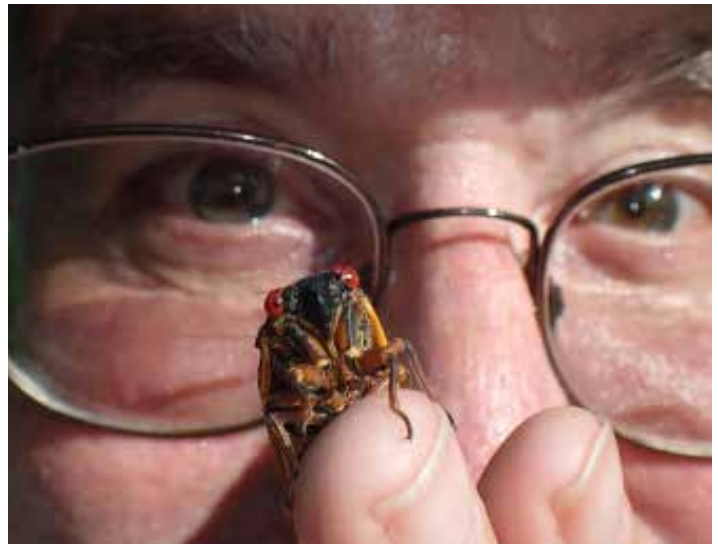
After a 17-year sleep deep among tree roots, Cicadas emerge to sing their songs that fill the woodland air with a music like no other.