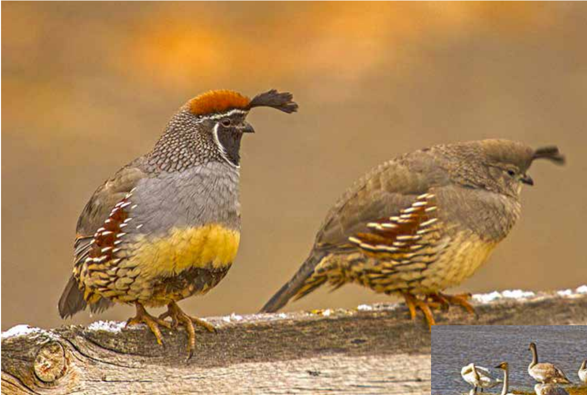
Photo Left: Gambles Quail Below: Tundra Swan Right: Elk