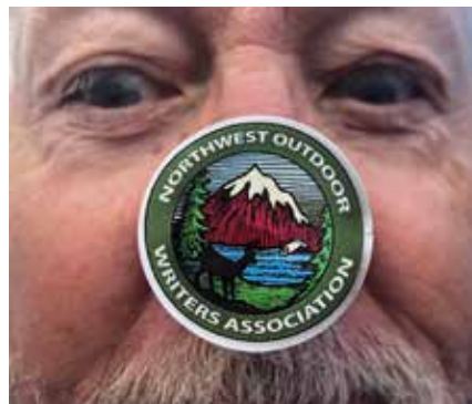
Photo far left: Over a hundred years ago cattle ranchers used branding irons on their cattle for identification. Today placing identification on objects is alot less painful.

Our work is a type of consumable. Articles once published can be recycled as evergreen articles and continue to pay a dividend. We recycle things that still have value. Make sure your brand represents value and your work will continue to be in demand. Your brand speaks for itself.