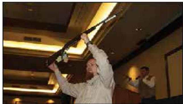
The charisma to make a sexy gun look sexier.