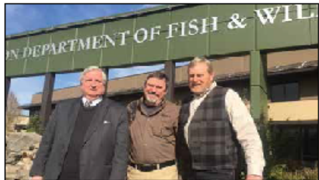
Ability to work independently, yet closely with OHA staff & volunteers across the state.

Much of the equipment and know-how needed to do the job is already in place. We simply need an effective operator. The right person could work from a well organized home office.