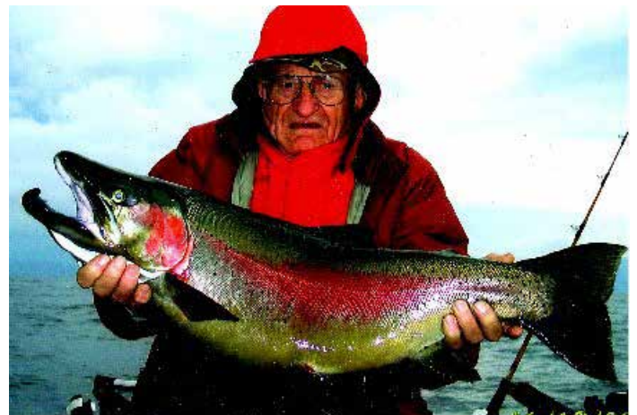
Large mackinaw (lake trout) caught last year and a 20# 5 oz. rainbow caught a few seasons back from Lake Pend Oreille.