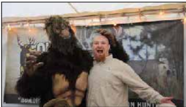
The people skills to soothe a savage beast.