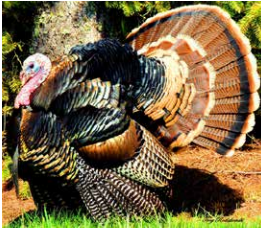
A Colorful Rio Grande Gobbler Struts His Stuff in the Warm Spring Sun.

Idaho's spring gobbler season runs April 15, 2017 through May 25, 2017. Most of the Panhandle units are all open under a general tag and a 2nd tag can be purchased anytime before season's end with no wait period.