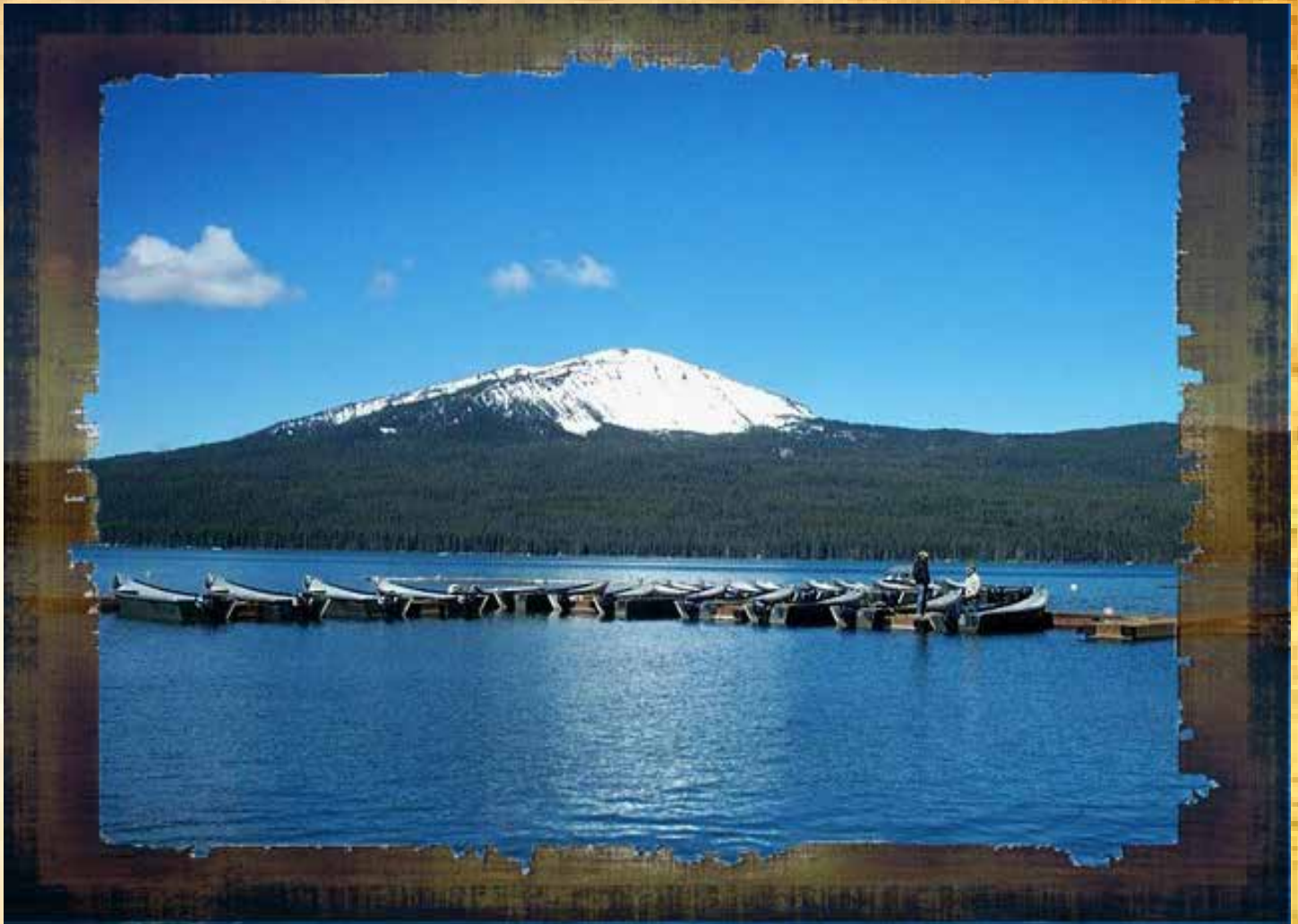
...Mount Bailey, Diamond Lake Resort Boat Dock, Photo Courtesy Diamond Lake Resort

CONFERENCE WORKSHOPS/OUTINGS SCHEDULE CONFERENCE REGISTRATION FORM PHOTO SHOOTOUT/PEOPLES' CHOICE CONTEST INFO CRAFT IMPROVEMENT MEMBER/SUPPORTING MEMBER NEWS ATTEND NORTHWEST TRAVEL WRITERS CONFERENCE