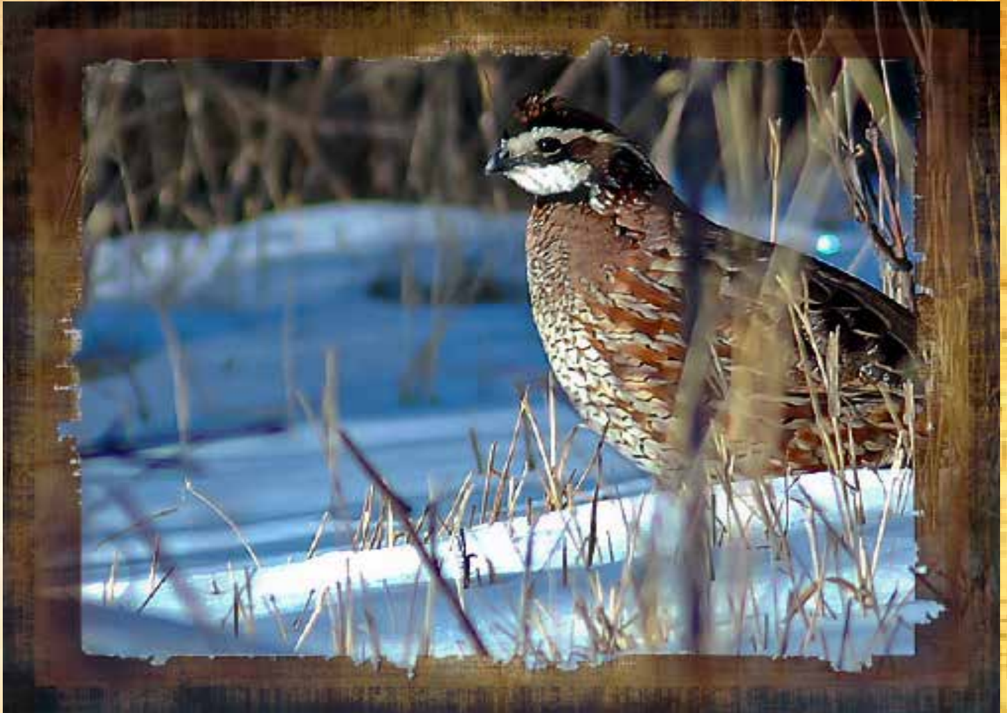
Bobwhite In Snow