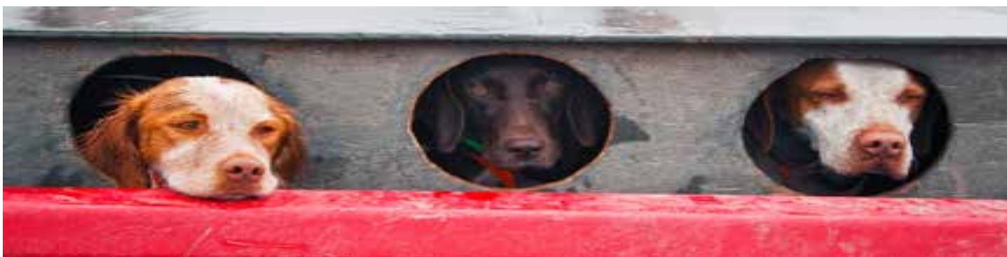
...Bird Pointin' Machines