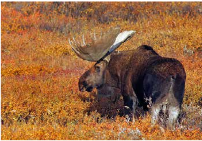
...Alaskan moose