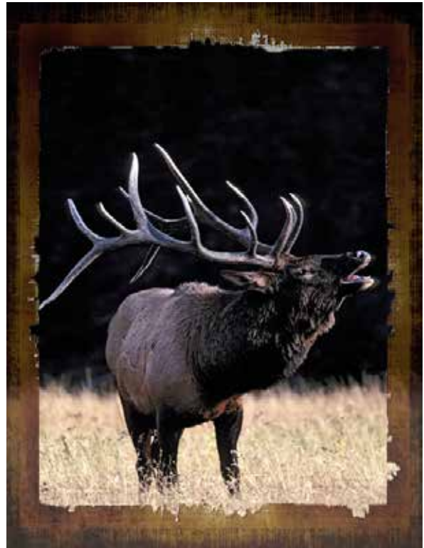
...Imperial Bull Bugling