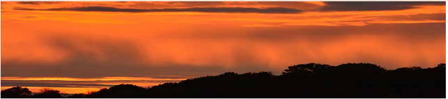
...Michel Herzen photo