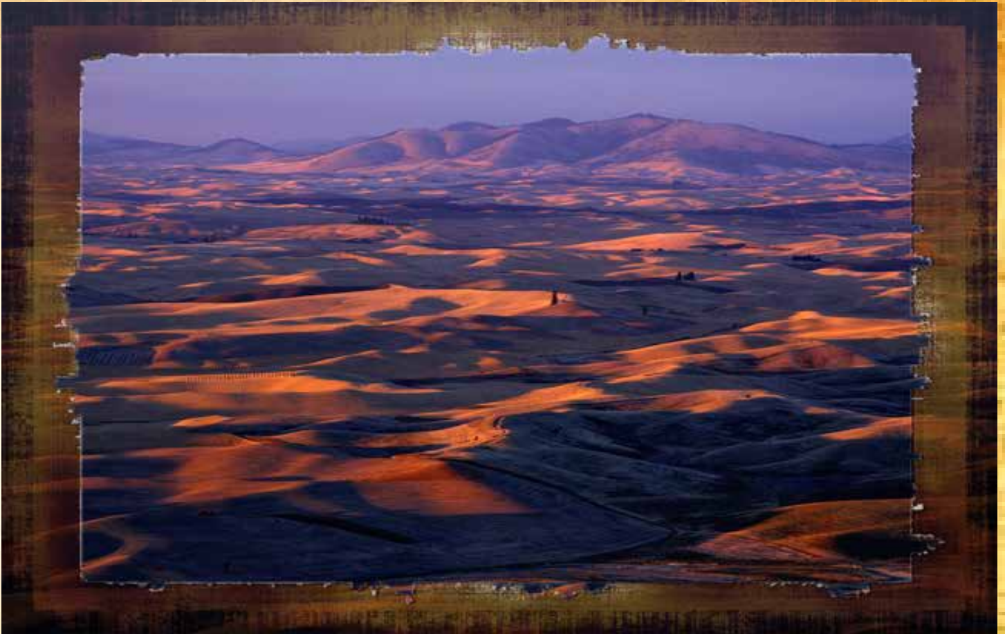
The Palouse, WA

NOWA EXECUTIVE DIRECTOR SEARCH JOB OPENING CRAFT IMPROVEMENT MEMBER NEWS SUPPORTING MEMBER NEWS