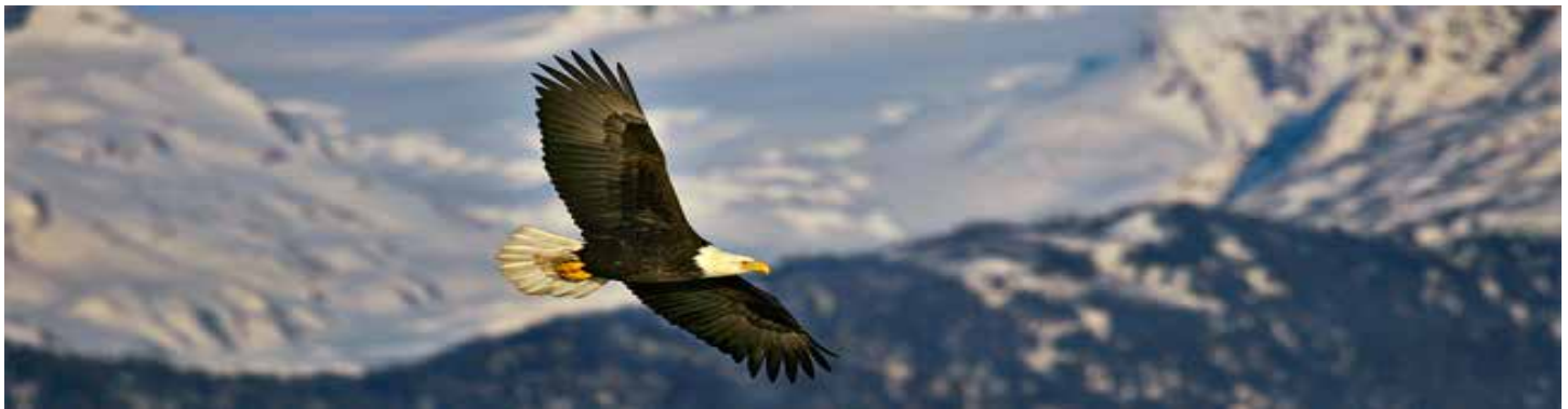
Eagle Soaring, Mission Mountains Wilderness, MT