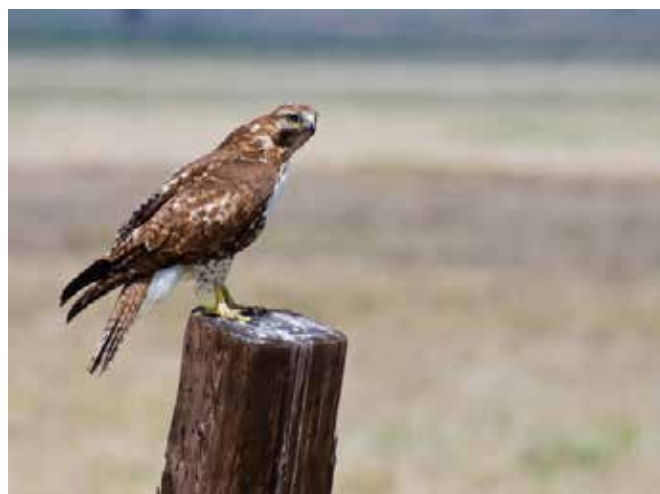
From Top: Wilson’s Phalarope, Western tanager, Prairie falcon...Chuck Robbins photos