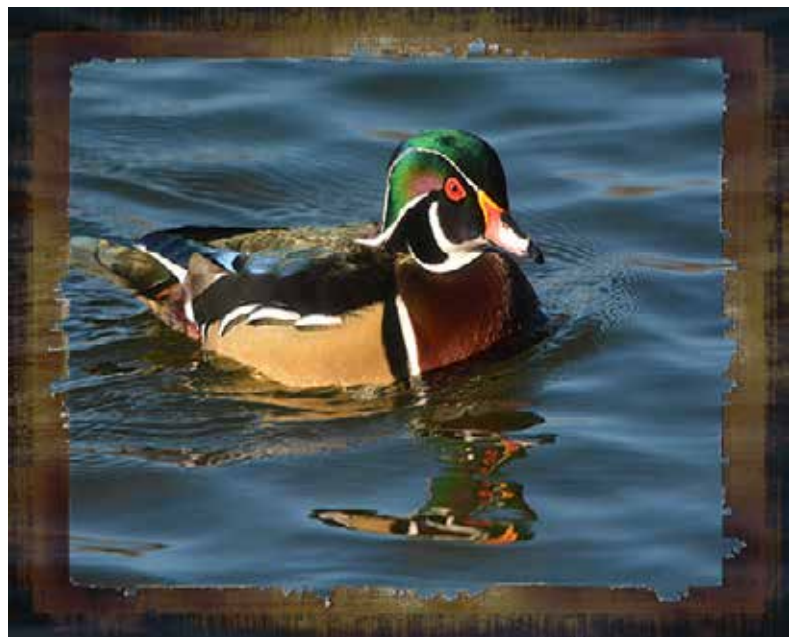
...Michel Hersen photo