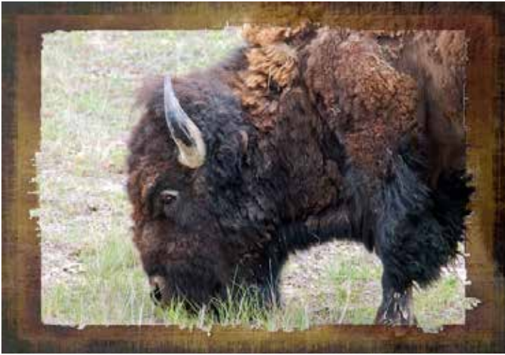
...Chuck Robbins photo

If you would like to contribute a photo gallery for consideration in future issues please submit 6 to 10 images, sized to approximately 6X9 inches at 72 or 96 ppi to crobb@bresnan.net . While we can't promise to use them all, we can't use what we don't have.