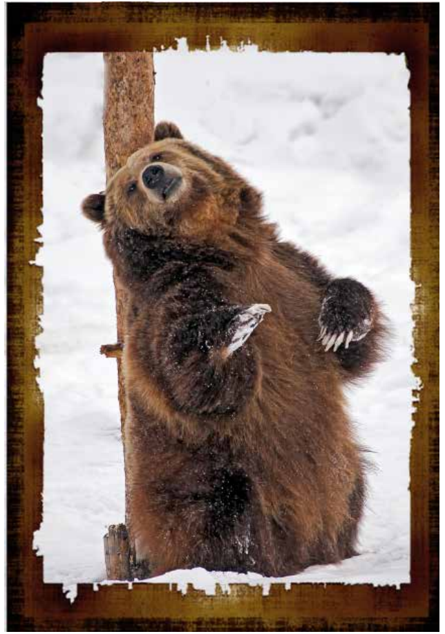
...Keith Szafranski photo