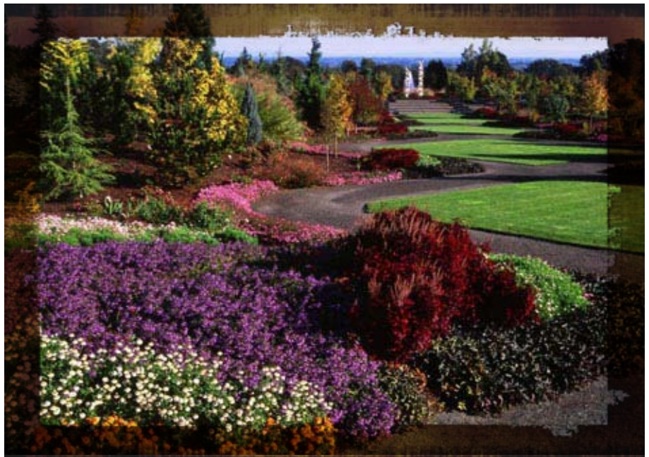
THE OREGON GARDEN