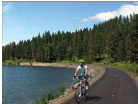
Enjoy a NOWA group bike tour along the south fork of the Coeur d'Alene River.

Take off for an excellent bass fishing excursion with a local bass aficionado to ply local waters for the wily ones. Bass fishing in May is consistently excellent with Lake Coeur d'Alene being listed by BASS MASTER magazine as a top bass fishery. Boats leave the Rainy Hill dock south of Rose Lake about 30 miles west of Wallace. Reservations need to be made 5 days in advance. Two anglers/boat. $50/$100; half or full day. Tony McCalmant 208-661-4593; Chad Kaiser 208-755-2677. • Trails of the Coeur d'Alenes Bike Ride: May 6; noon. All aboard your 2 wheeled stallion with other NOWA attendees for a super smooth, almost flat ride on the acclaimed, paved, non-motorized Rails-Trails bike path. Excelsior Cycle will provide the bikes and a shuttle to and from the trailheads allowing you to ride in comfort with a guide to tell the stories of the landscape. See abundant flora and fauna while whisking along the south fork of the Coeur d'Alene River. Reservations must be made 72 hours in advance. Shuttle leaves/returns from/ to the Wallace Inn. $10. 208-786-3751. 2 hours.