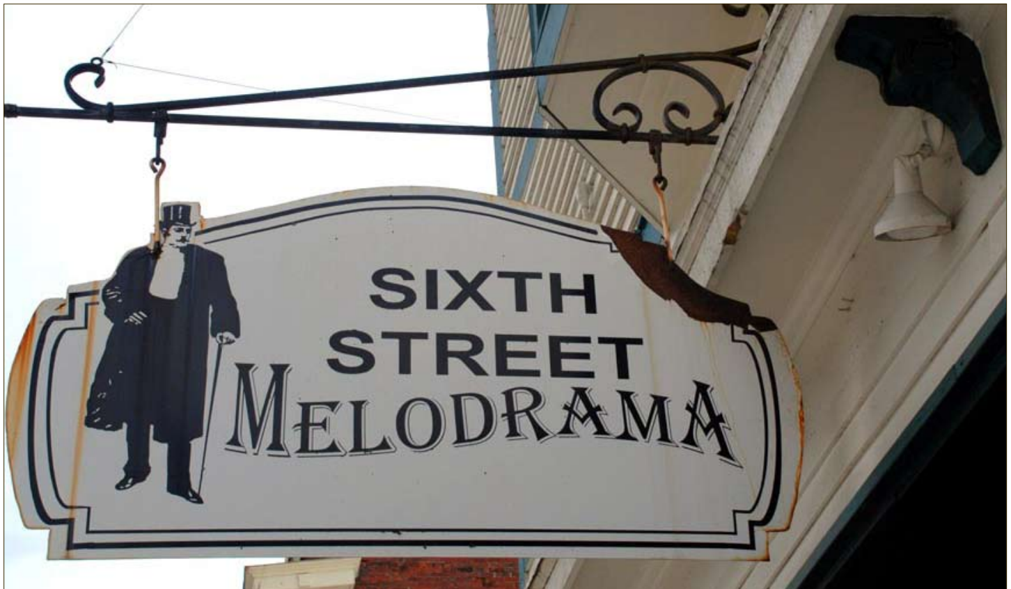
JACK McNEEL www.mcneelwesterntravels.com

A former bordello, the 6th Street Melodrama is a live theater now. It holds about 100 people in a still-intimate atmosphere.