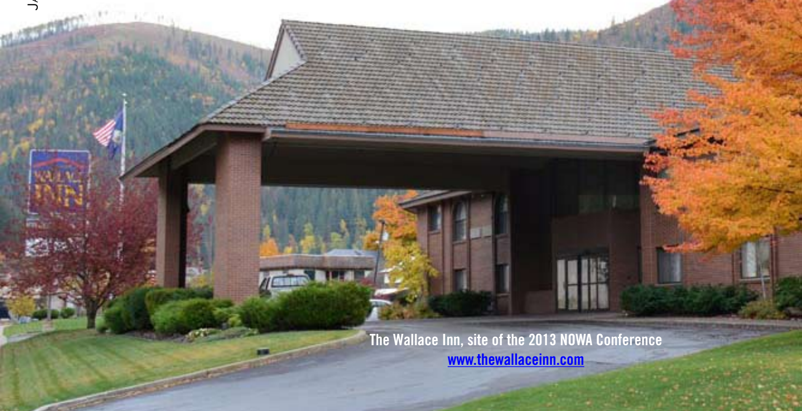
The Wallace Inn, site of the 2013 NOWA Conference

Everything Else: Kyla Merwin Cheney nowa@kmc-media.com