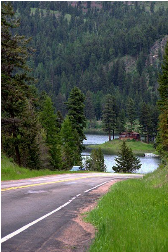
Highway 83 through Seeley Lake