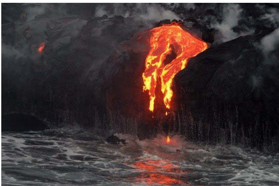
Dave's photo of lava flowing into the Pacific from Big Island of Hawaii

Easy Thumbnails (2 MB download) as its name implies, takes full size digital images and makes thumbnail size images quickly and easily. At only 2 megabytes, it's a small program. If you only have a few photos to work on, you don't need a special program to make thumbnails but when you have dozens, Easy Thumbnails is a real time saver. After a day of shooting, I like to download my images, delete the ones that didn't turn out and let Easy Thumbnails convert the rest to thumbnails. Then it's easy to upload the images to an online photo album to share with editors and friends or put them on Facebook or some of the other Internet Blog sites I like. After all, the more people that see your pictures the better chance you have that someone will want to buy them.