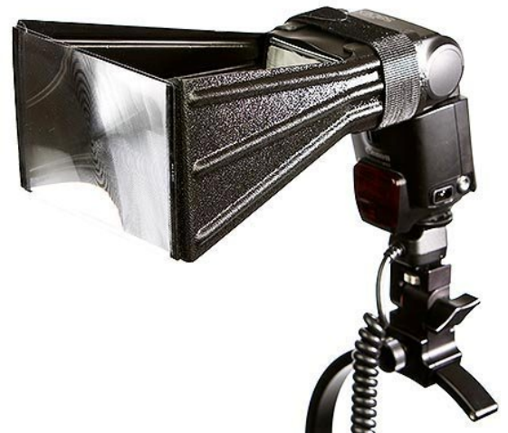
The Better Beamer

If you have any questions on these two flash modifiers or need help selecting the correct unit for your flash, feel free to contact me at: jlawton@wbhunt.com or 1-800-221-1830.