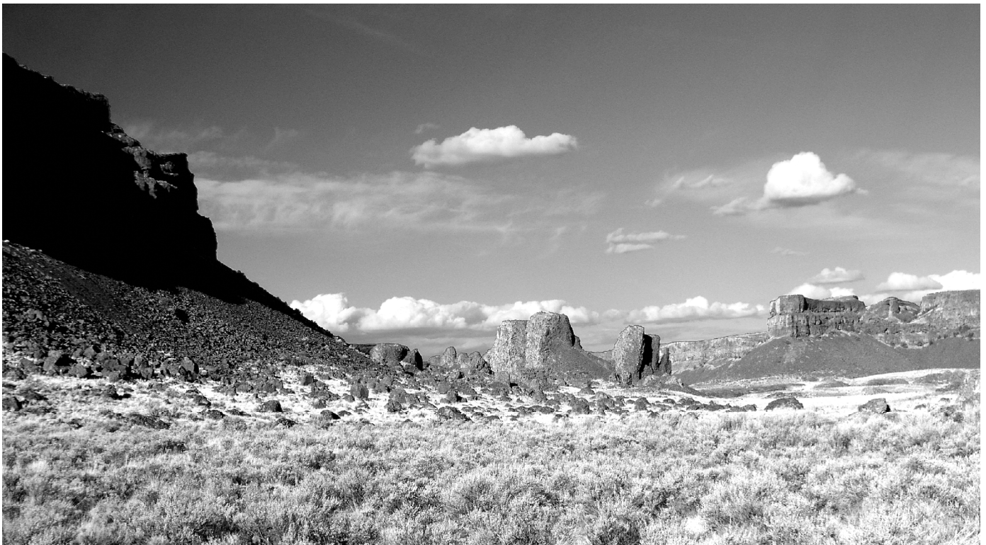
Eastern Washington in B&W can, in many instances, evoke a more dramatic interpretation.

What a delight it is to once again, enjoy the equivalent of large-format, black-and-white photography -- along with the tremendous advantages of digital photography and Photoshop®, today's desktop darkroom.