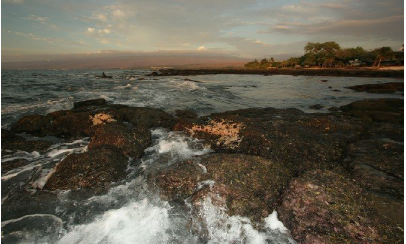
The Pacific from Big Island of Hawaii